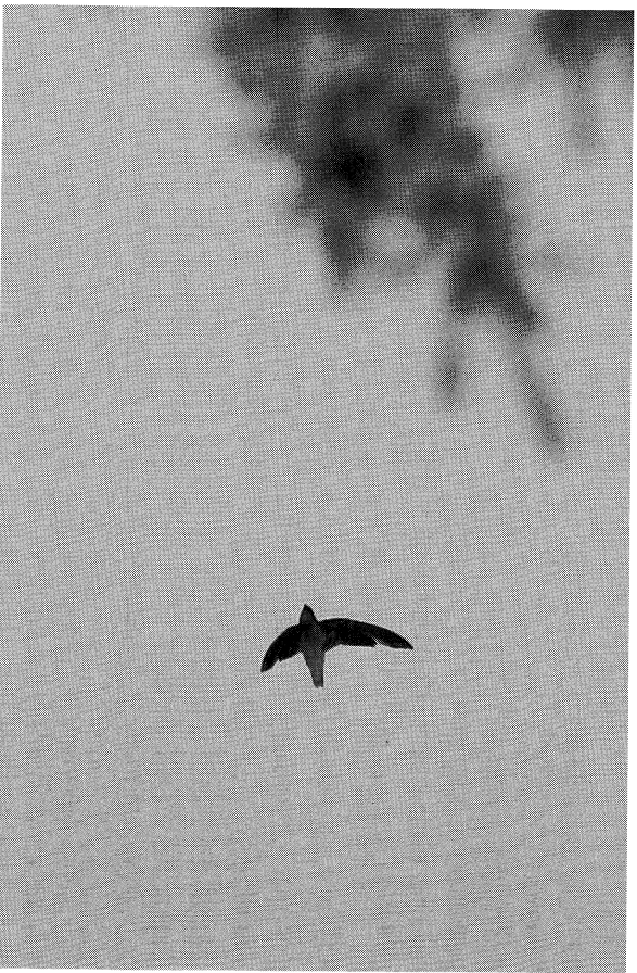
Top and bottom - Chimney swifts flying