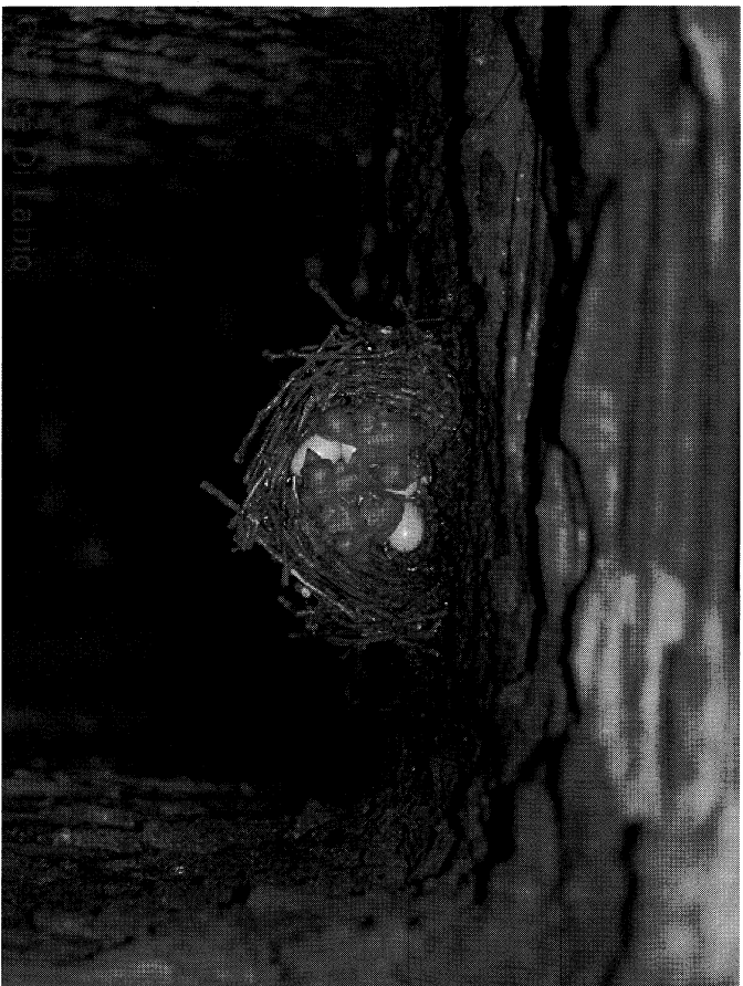
Recently hatched chimney swifts and unhatched egg. Hatchlings cannot regulate their body temperature and require brooding until they are 6-7 days old.